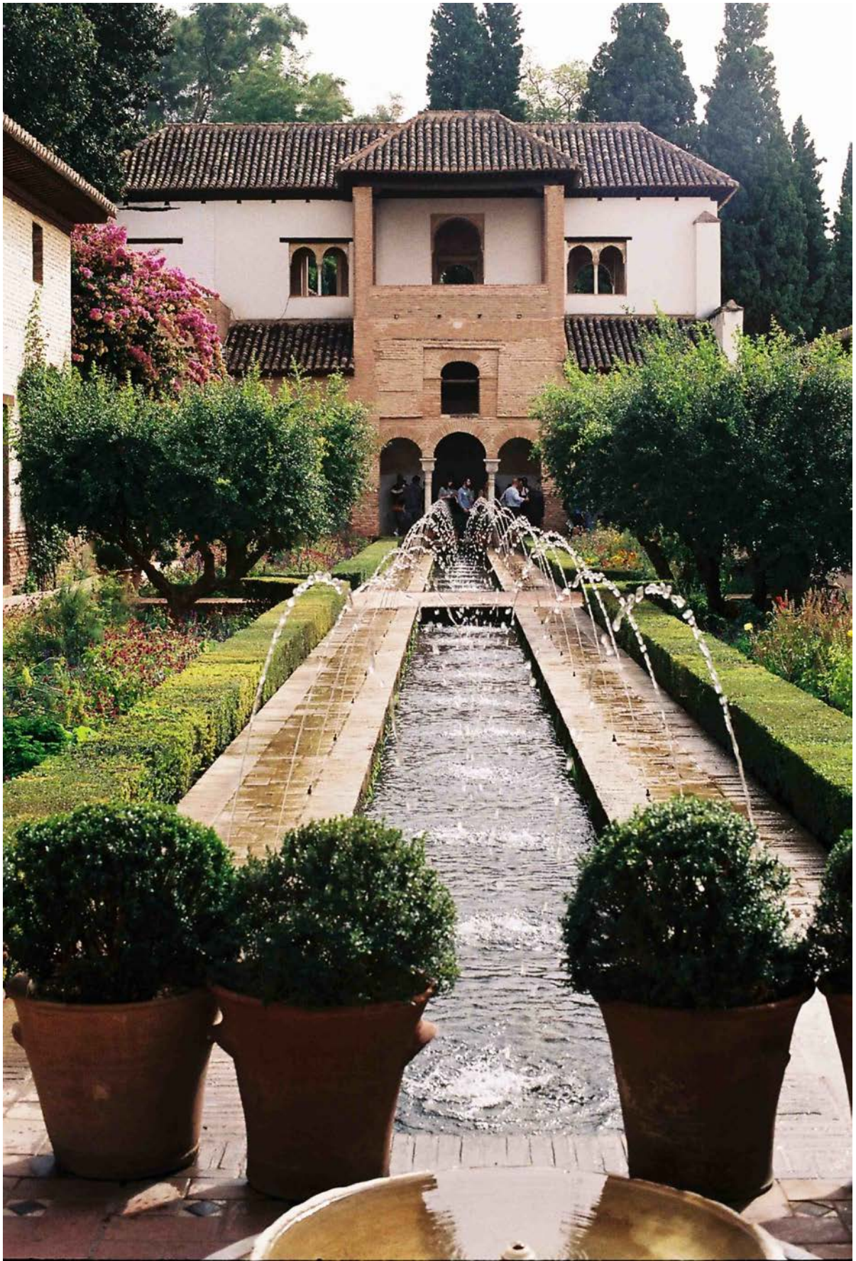
That's enough for now from one of the most impressive destinations to be discovered in the world.