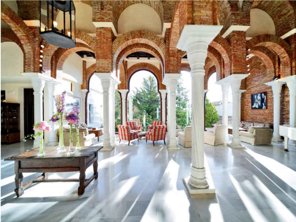
Alhambra? Not exactly. This impressive building is our ***** Hotel La Bobadilla ...