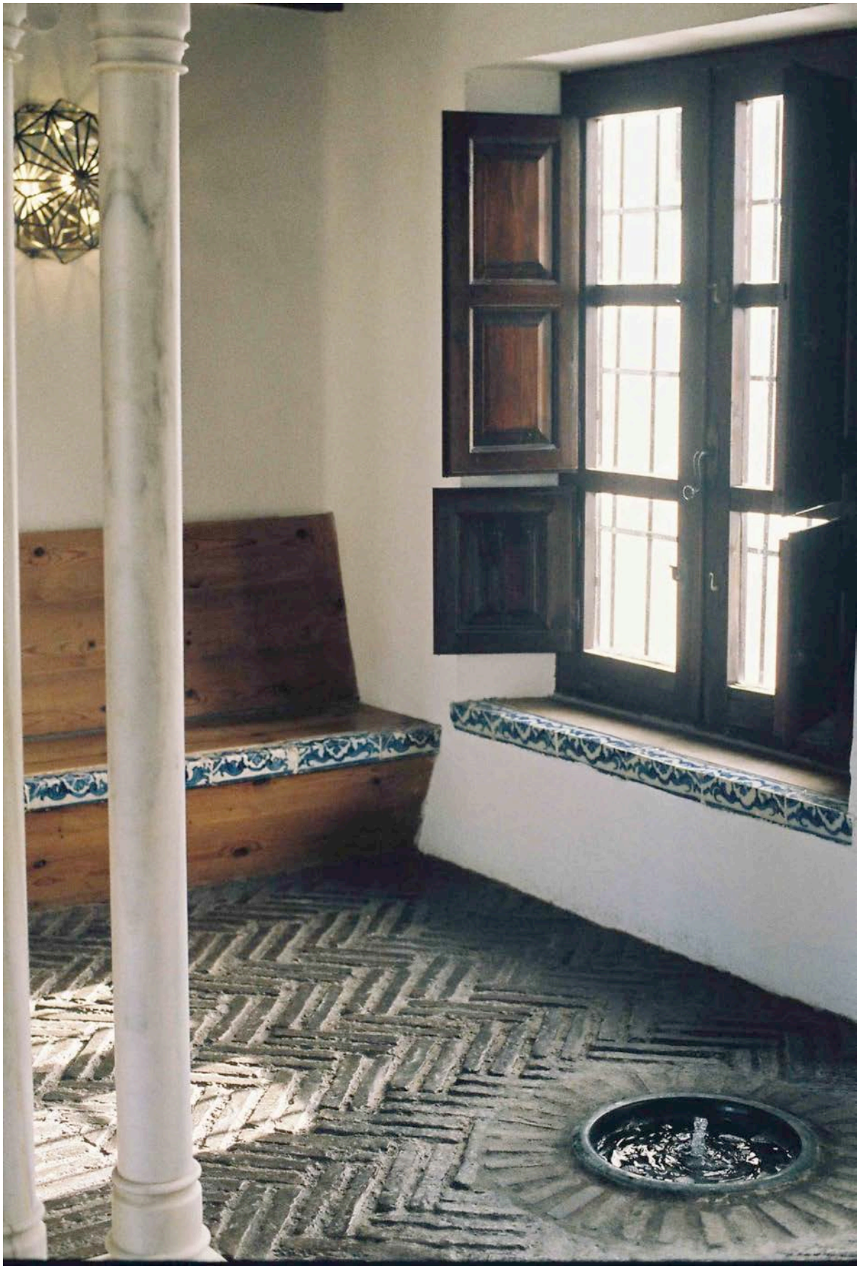
particular architectural details, too, in line with the Moorish history of the region.