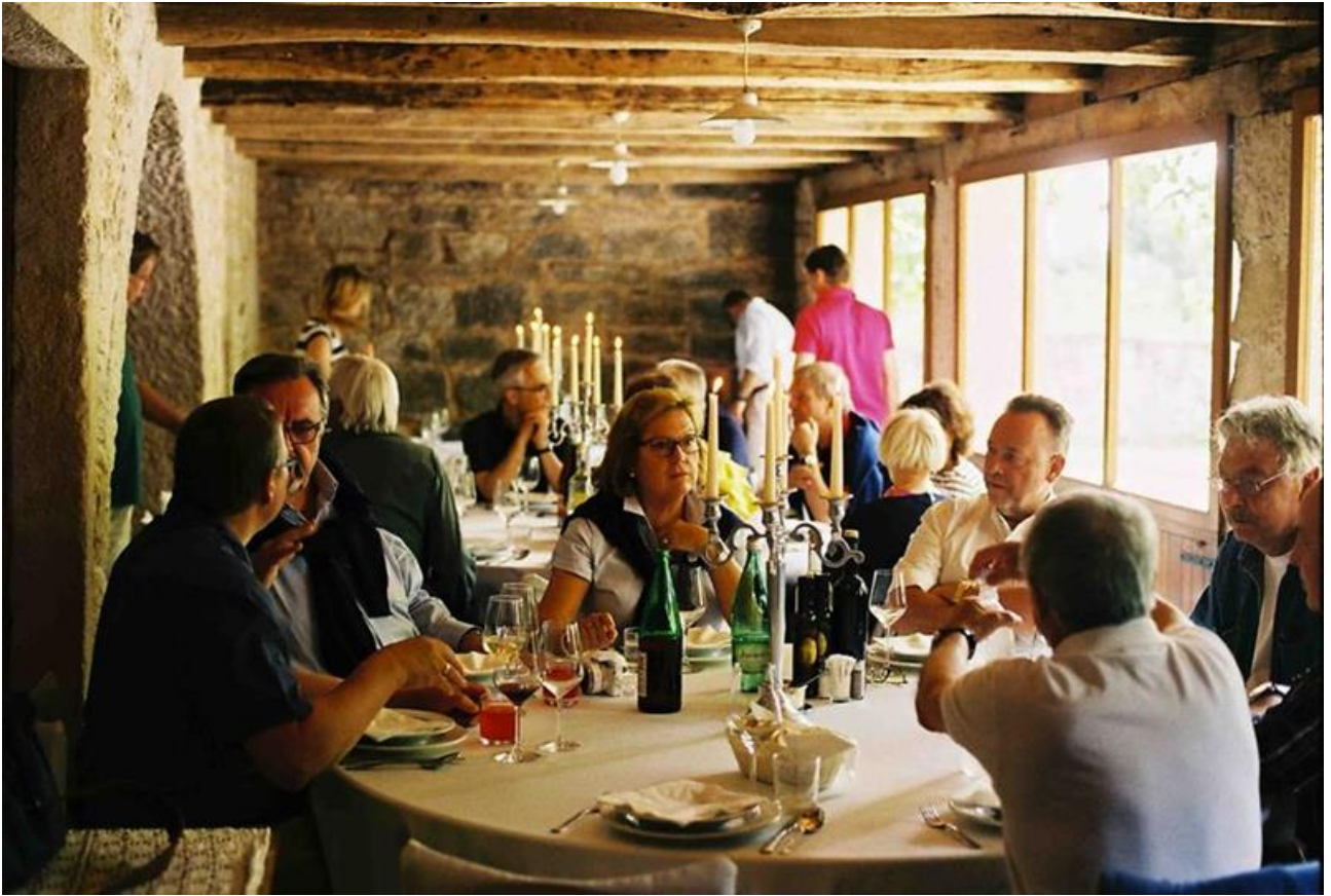
... and the family recipes top it all.