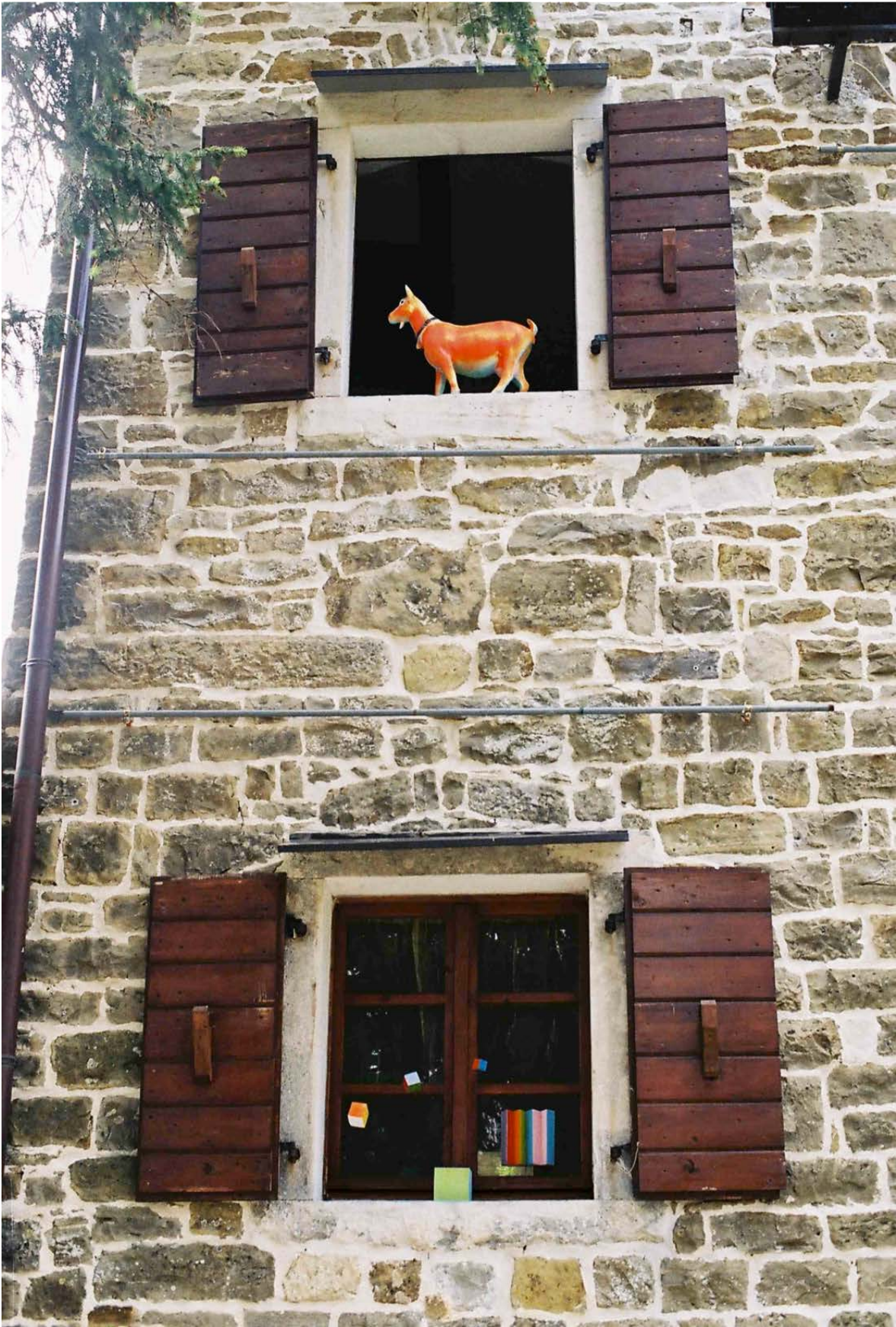
Old houses have been lovingly restored and given a special charm by the sensitive touches of the artists.