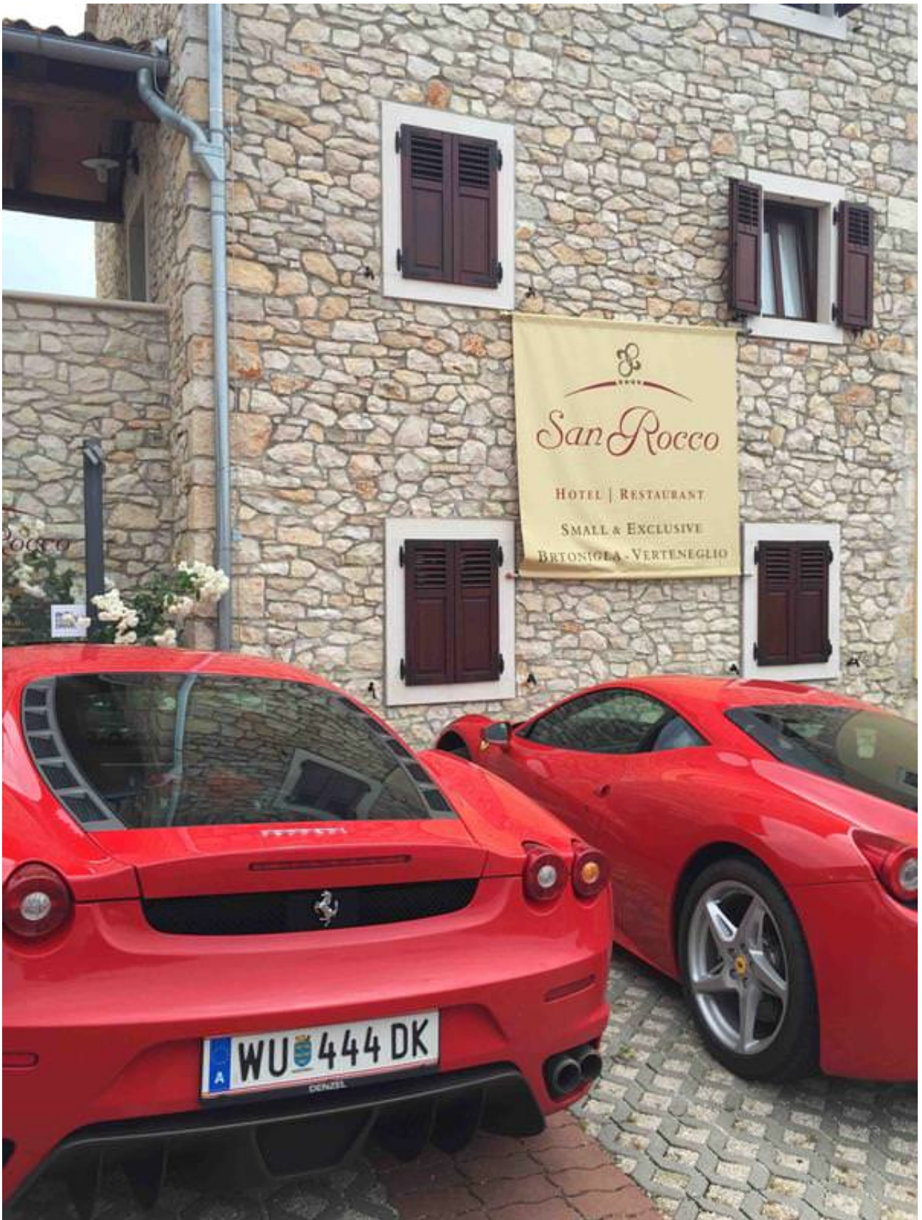
So it was time to drive to Brtonigla - Verteneglio and the excellent restaurant San Rocco. Finally there was something to eat and everyone was happy ...