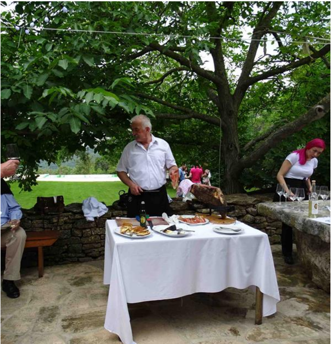
As we had already learned during the preparation to the Fly-In, the Paladnjaki estate is not a restaurant in the classical sense.