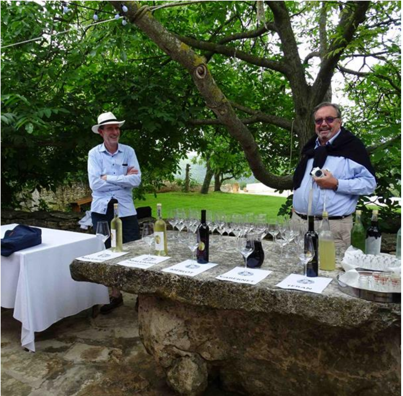
The family raises and grows their own basic ingredients for such an exquisite meal. Everything you get as a guest here is home produce...