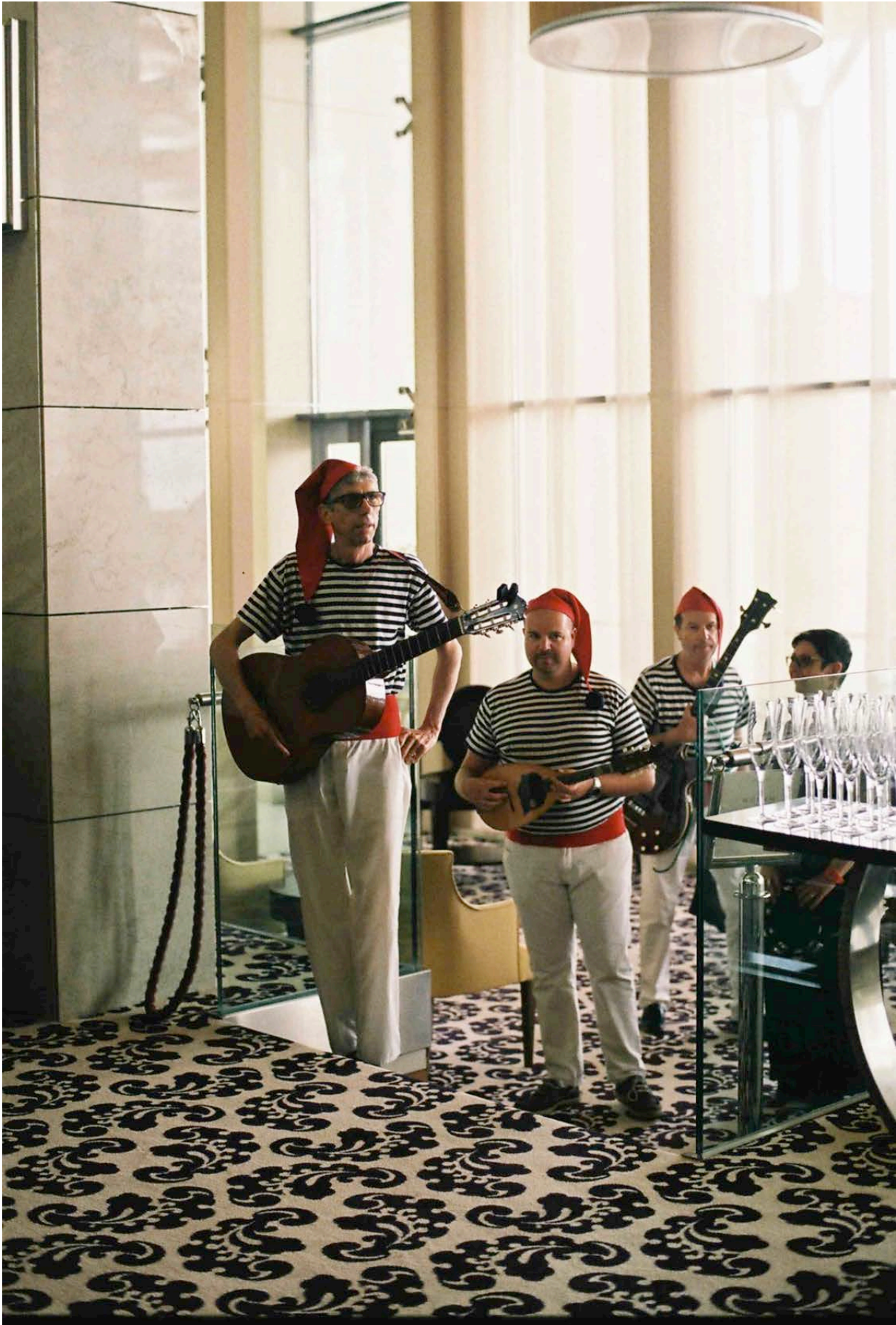
The Welcome was accompanied by Klappa Maestrali and their regional interpretations, as was our dinner at the MM Gourmet Restaurant Wine Vault.