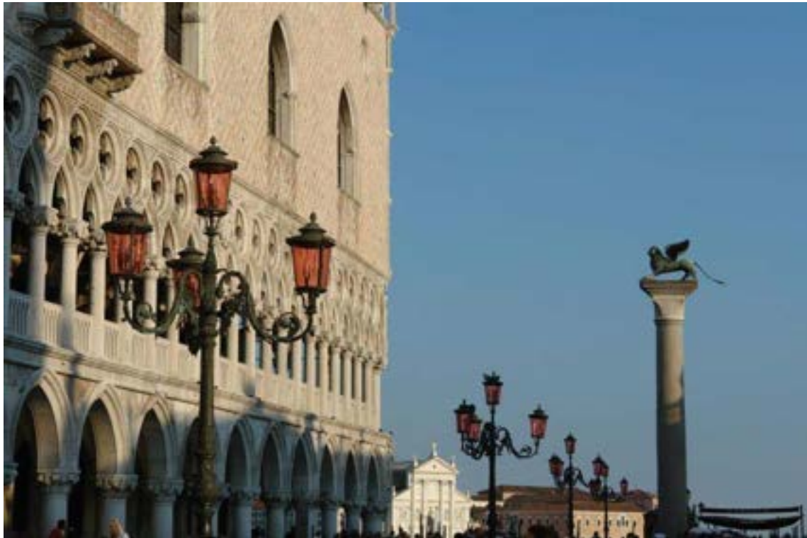
Guided tour of the Doge's Palace and St. Mark's Basilica.