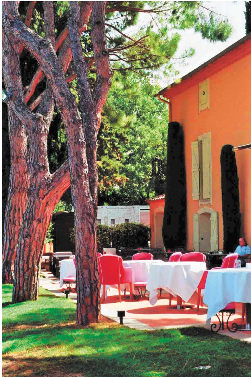
The hotel's Michelin-starred gourmet restaurant is, among other things, on a wonderful terrace under the pines with views of Grasse in the distance.