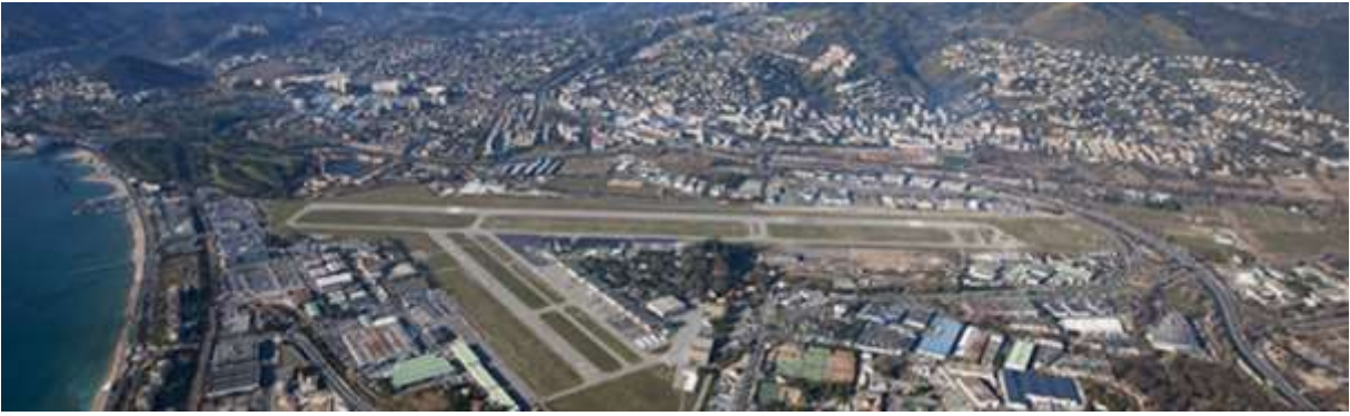
Our airport is Cannes-Mandelieu - LFMD.