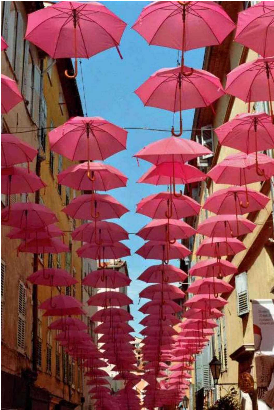
There is art everywhere!

St.-Paul de Vence offers many interesting impressions on a walk along the approximately 1,000-year-old footpaths in this artist town.